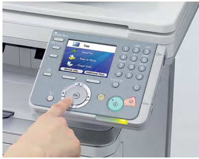
Easy-Scroll Wheel allows effortless access to all functions